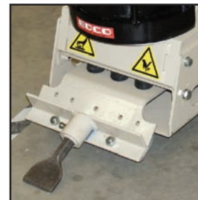
Optional Ceramic Chisel Kit available Part# 28375