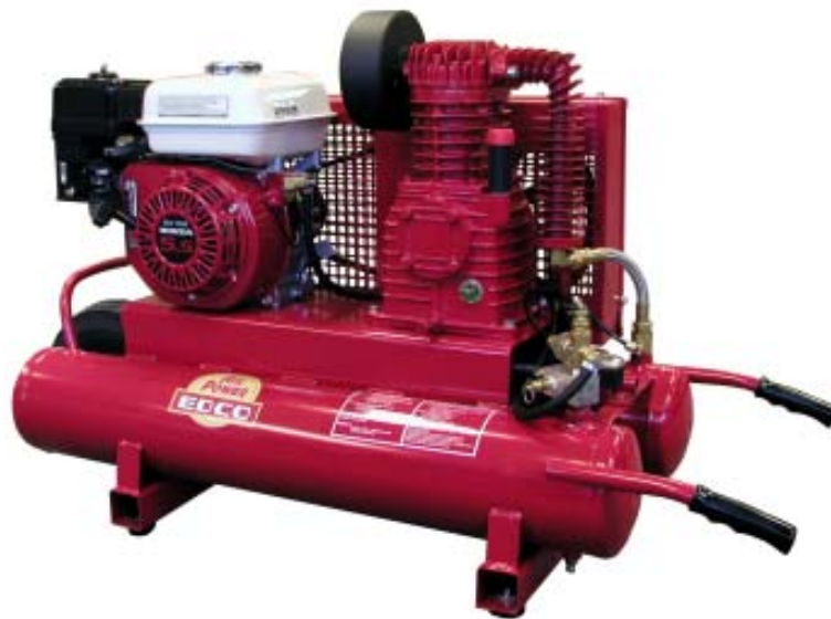
Portable Air Compressor Part No. 95100